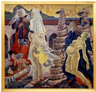
The Cloisters Tsunami , 2002-2005