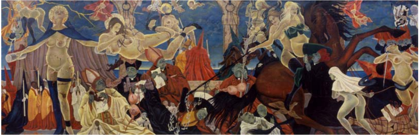
The Cloisters/Venus and Pope's Bullfight , 2006-07