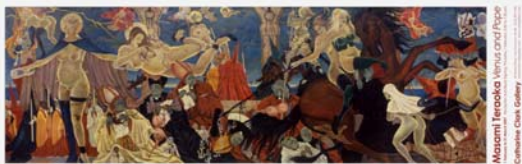
Broadside: Masami Teraoka: Venus and Pope 1 February – 31 March 2007; image of The Cloisters/Venus and Pope's Bullfight, 2006-07 ; 10 ¾" x 35".