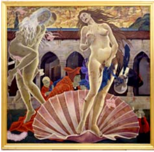
The Cloisters/Birth of Venus, 2002-06 Oil on canvas in gold leaf frame 96 ½" x 100 ½" framed