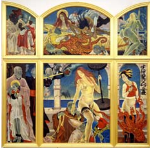
Venus and Pope's Workout, 2004-06 Oil on panel in gold-leaf frame 119 ⅛" x 123 ½" x 2 ¾" open 119 ⅛" x 61 ¾" x 5 ½" closed