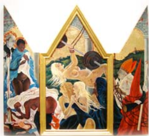
The Cloisters/IVF Ring , 2006-07