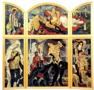
The Cloisters/Holy Sea Pregnancy Test, 2006 Oil on panel in gold-leaf frame 126 ⅛" x 130 ½" x 2 ¾" open 126 ⅛" x 65 ¼" x 5 ½" closed