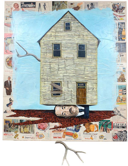
Travis Somerville, Atrophied Landscape , 2009 Oil and collage on canvas with antler, 107 x 78 x 14 inches

Travis Somerville was born in 1963 in Atlanta, GA. Raised in towns throughout the southern United States and along the eastern sea board, he briefly studied at Maryland Institute College of Art, Baltimore, MD, finally settling in San Francisco where he attended the San Francisco Art Institute, CA. His large-scale oil paintings incorporate collage and present images of